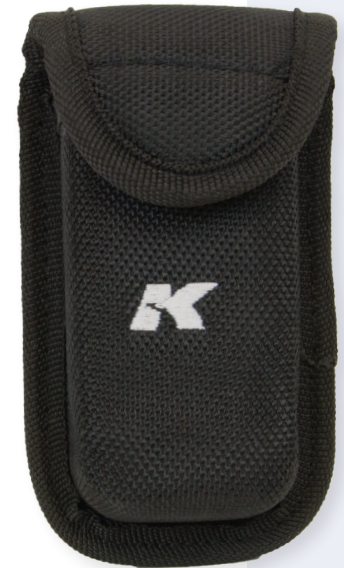
Carrying case included